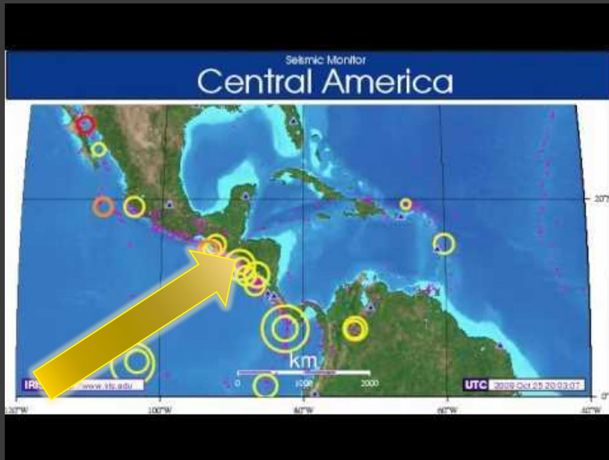
Shows seismic activity (movement in the earth's crust)